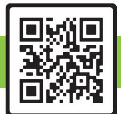
Scan for the most up-to-date information