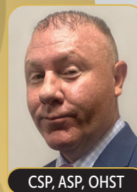
CSP, ASP, OHST