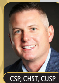
CSP, CHST, CUSP