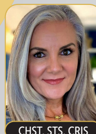
CHST, STS, CRIS